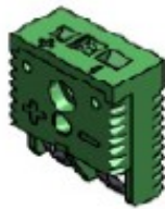
Basic Panel Insert Back mounted with assembly set