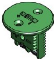
Round Insert Front mounted with screws