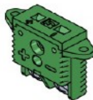
Lug Insert Front mounted with screws