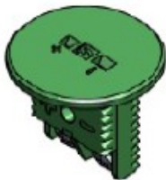
Round Insert Back mounted with brass nut and spring set