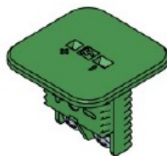
Square Insert Back mounted with brass nut and spring set