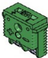
Collar Insert Back mounted with assembly set