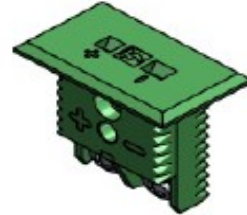
Rectangular Insert Front mounted with brass nut and spring set